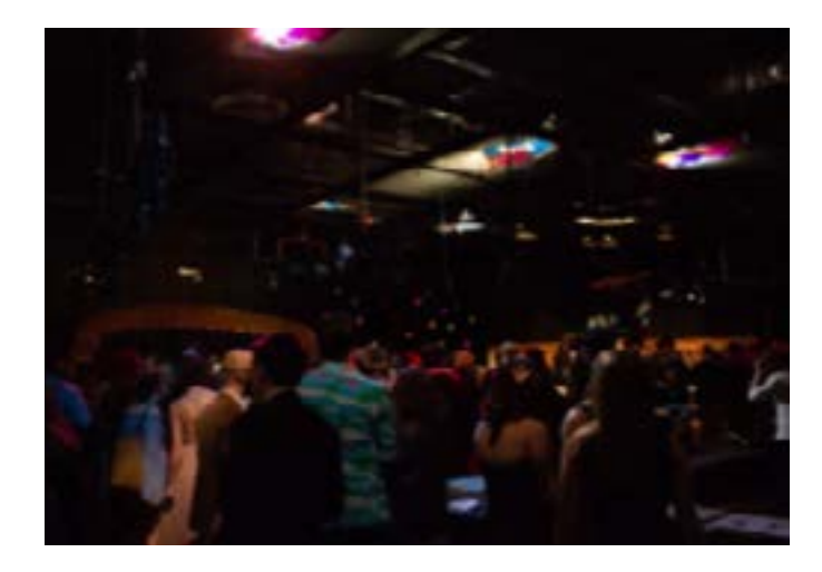
Above: Attendees enjoy the general reception.

Below: VIP winners show off their awards during the red carpet portion of the evening in the Miller Communication Arts building.