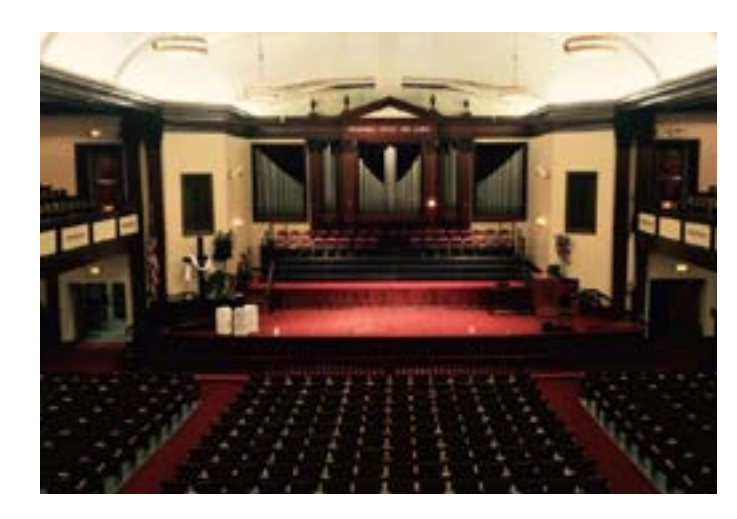
Above: Hughes auditorium, where the awards show takes place.

The 15th year of the Highbridge Film Festival, a student-run, student-led film festival at Asbury University in Wilmore, KY, was designed to be a whimsical experience honoring the last decade and a half of films while catapulting the festival into the future. With this in mind, we sough to intergrate color, dreamscapes, and a mood of celebration into thoughtful, beautiful design of the spaces our team was provided.