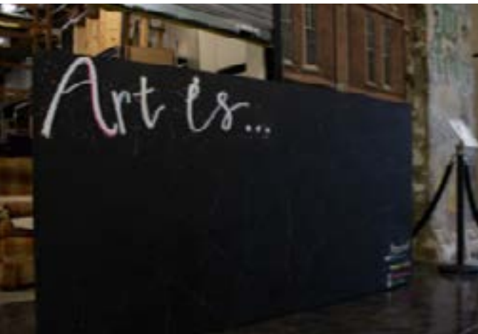
Above: Interactive art pieces such as this chalk wall were created for attendees to fill in the blank with what they believe art is.

Below: Cotton candy chandeliers were created (left) for the general reception while origami chandeliers (right and bottom) were hung in the VIP reception hall.